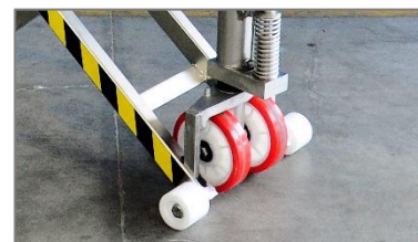
Lateral axles for maximum stability

CARRELLIFICIO CESENATE DI MINOTTI MARCO & C. SNC