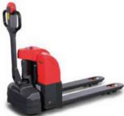
Electric pallet truck Load capacity kg 1.500 Forks 540x1.150