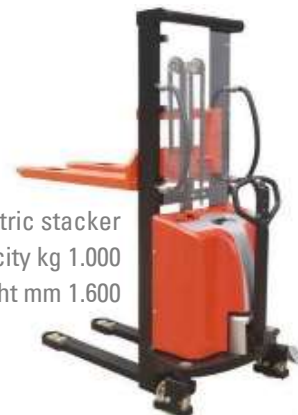
Semi-electric stacker Load capacity kg 1.000 Lifting height mm 1.600