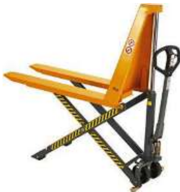
Hand shissor lift Load capacity kg 1.000 Lifting height mm 800