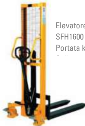
Elevatore manuale SFH1600 Portata kg 1.000