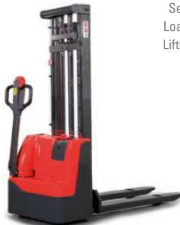
Electric stacker Load capacity kg 1.000 Lifting height up to mm 3.500