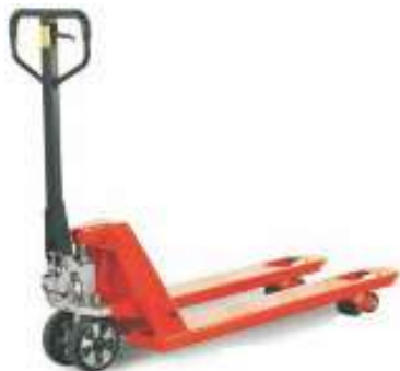
Hand pallet truck Load capacity kg 2.500